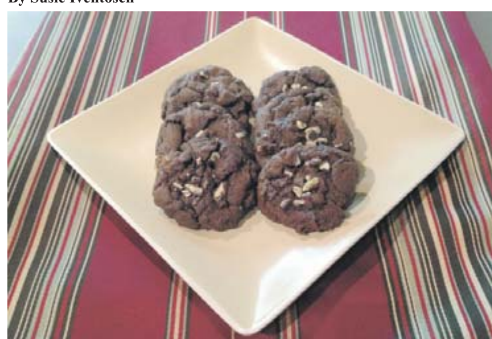
Andes Mint Chocolate Cookies