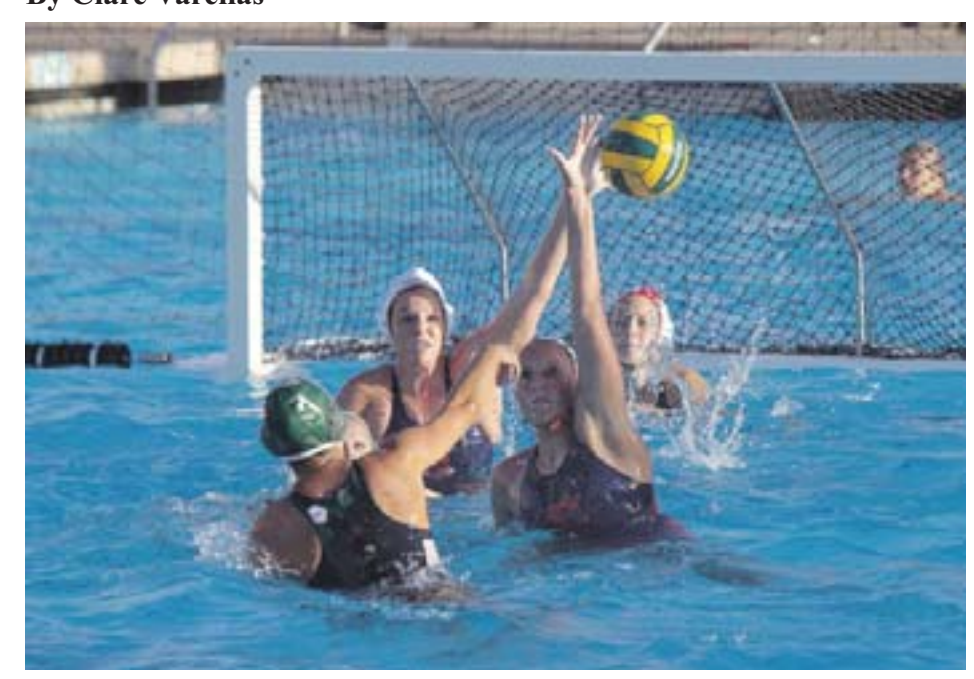
Miramonte scored four goals in the fourth quarter, but it wasn't enough against Campo's defense

ver the past month, the high school water polo teams have faced off with a number of rivals in-and-out of the DFAL to prepare for the season, and Oct. 2 marked the first game of intra-DFAL play to determine this year's league rankings.