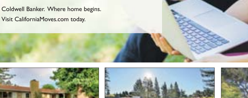
$1,290,000 ORINDA 3/2.5. Large lot with room to expand, updated single story located close to

elem school Bata/McAtee BRE#BRE01435229/01349169 Lynn Molloy