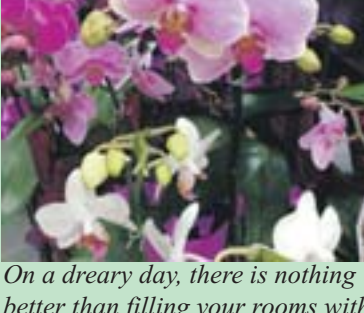
better than filling your rooms with orchids.

Follow us on Twitter (advancetree) and like us on Face Book (ADVANCETREESERVICEANDLANDSCAPINGINC.)