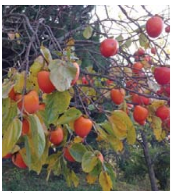
Like glittering ornaments, Hachiya persimmons hang on a winter tree.

ing trees provide wondrous gifts of nature during December. Persimmons, quince, chestnuts, and pomegranates offer exotic flavors for holiday gastronomy. The delicious and juicy Hachiya persimmon is the perfect fruit to flavor many holiday dishes, including Christmas puddings and fruitcakes. These beautiful pointed persimmons resemble bright orange ornaments hanging on the bare branches. If they are firm when picked, allow them to sit on a plate on the counter until soft. They can then be enjoyed raw or cooked, but only when they are mushy. On the other hand, the Fuyu persimmon is flat, hard, and delicious eaten like an apple or sliced into salads. Once it gets soft, it can also be used in dishes that suggest Hachiya. When planting persimmons, keep in mind that it may take up to 10 years for a bountiful yield.