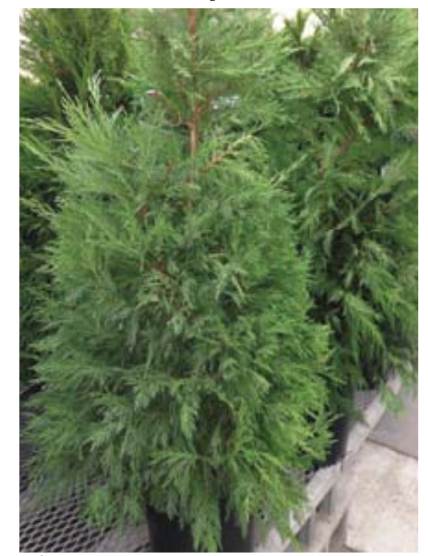
A live cypress tree in a container is a great replacement for cutting a tree.

Peace on earth. Good will to all. Be a child again on Christmas morning. May your stockings be filled with the seeds of winter wonders, hope, and love.