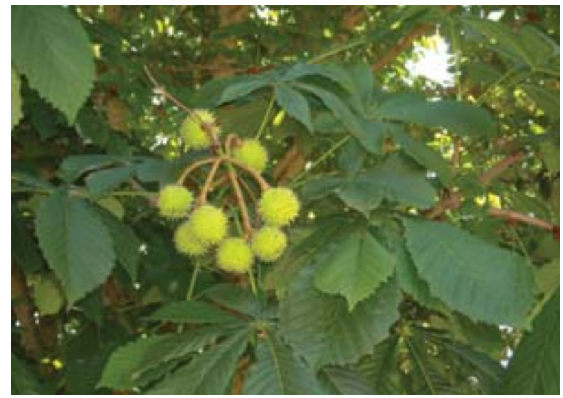
Chestnuts on a horse chestnut tree are not edible! They are poisonous.

Every day those who tend gardens work hand in hand with Mother Nature. As the Grand Dame, she is always in charge. Gardeners are her faithful stewards, nurturing the land that feed our bodies while clothing our spirits with beauty, fragrance, and spiritual wellness. As the earth settles down for its winter nap, we also slow our pace in our outdoor spaces to begin preparations for the holiday celebrations and a new year. ...continued on page D6