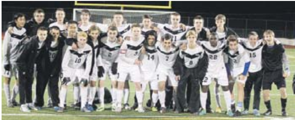
Dons earned their first DFAL win over Dublin last Friday.