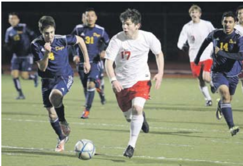
Campolindo is 2-0 after defeating Alhambra last Friday.