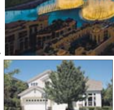
PLEASANT HILL $984,900 4/3. Rare,2962 SqFt on big lot w/ bedroom & full bath on main lvl.Big