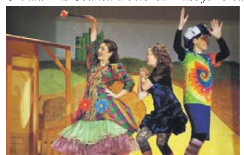
OIS production of The Wiz.

Orinda Arts Council a beloved Muse for creative minds of all ages