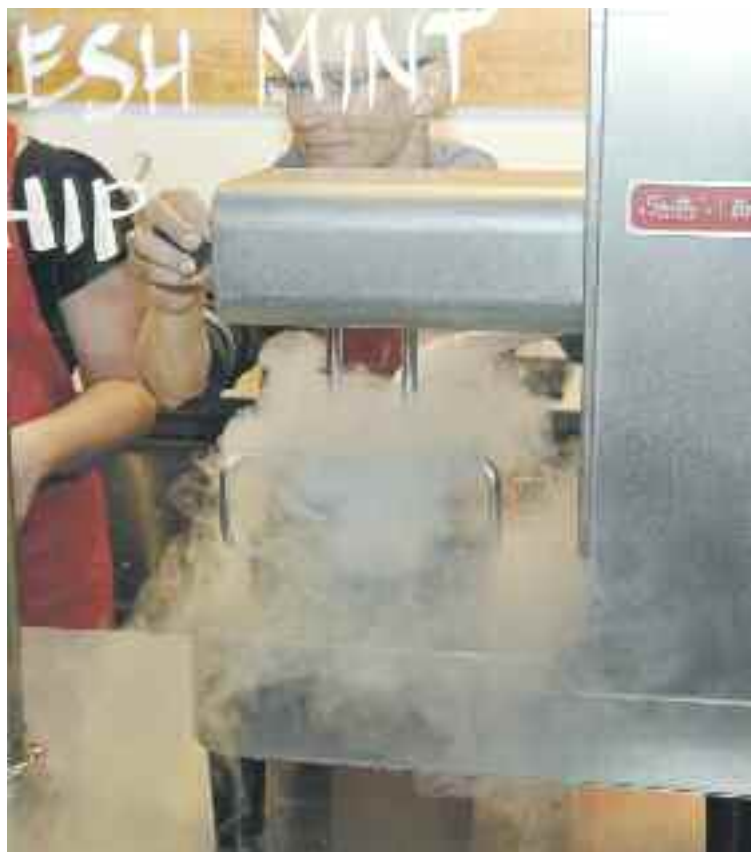
"Brrr" churns and instantly freezes ice cream.

Molecular cuisine is becoming main stream. Chin Chin Labs in London, Lab Made in Hong Kong, and now San Francisco-based Smitten, which just opened its fourth Bay Area location in Lafayette, offer liquid nitrogen creations to tantalize ice cream lovers.