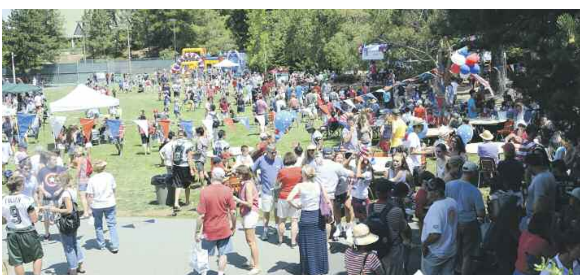
Lamorinda celebrates the Fourth of July in Orinda.