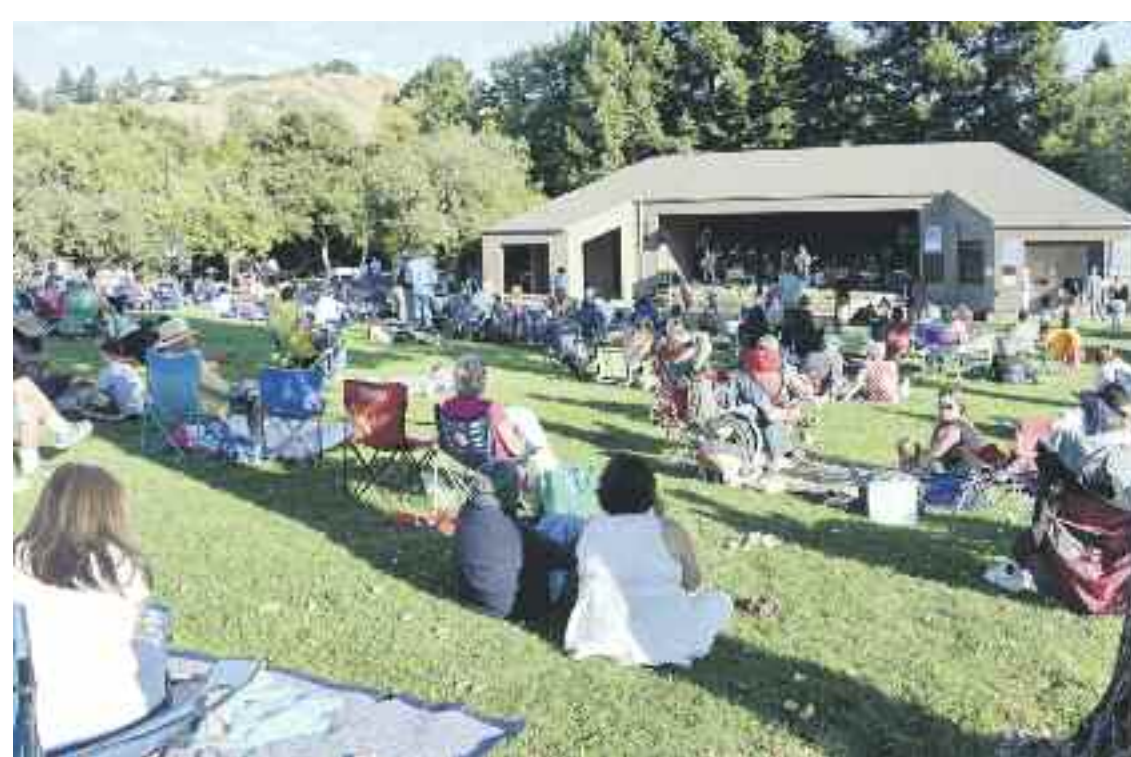
Summer Concert at the Moraga Commons Park