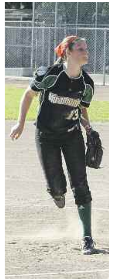
Gina Pagan Photos Gint Federas

As the school year comes to a close, so do the playoff aspirations of spring sports. The Acalanes and Miramonte softball teams entered the North Coast Section playoff tournament with different goals but both were eliminated in the first round.