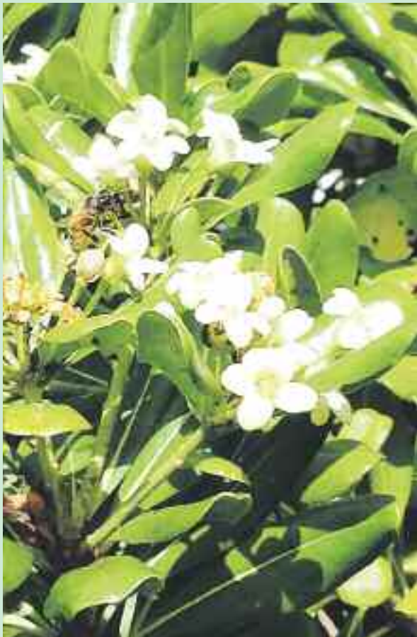
Mock orange tree attracts the bees.