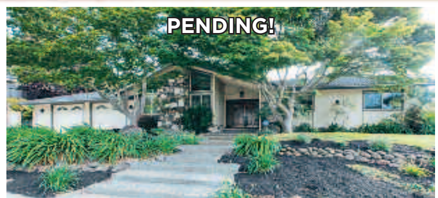
1223 Larch Avenue, Moroga • Offered at $1,195,000