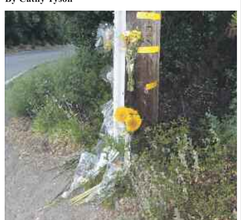
Makeshift memorial for the deceased at the corner of El Nido Ranch Road and Upper Happy Valley Road.