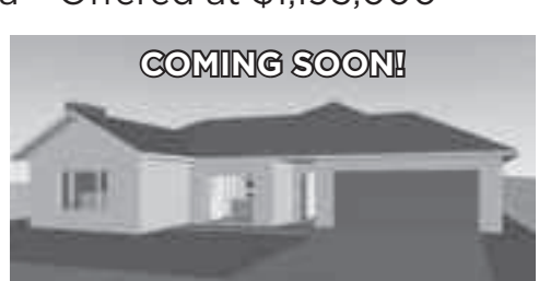
4 bedroom, 2.25 bath, 2142± sq. ft. Cul-de-sac. Call for Price & Details