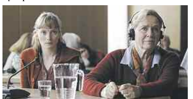
Actresses Juliane Köhler and Liv Ullmann star in "Two Lives."

Showcase in Orinda features "Two Lives" ("Zwei Leben"), which portrays the cruel destiny of people crushed by historical events beyond their control and the inhumanity of a totalitarian regime. The film, based on true events, is skillfully crafted and constructed – a noir mystery where glimpses into the past peel away layer after layer the lies that are covering a terrible truth.