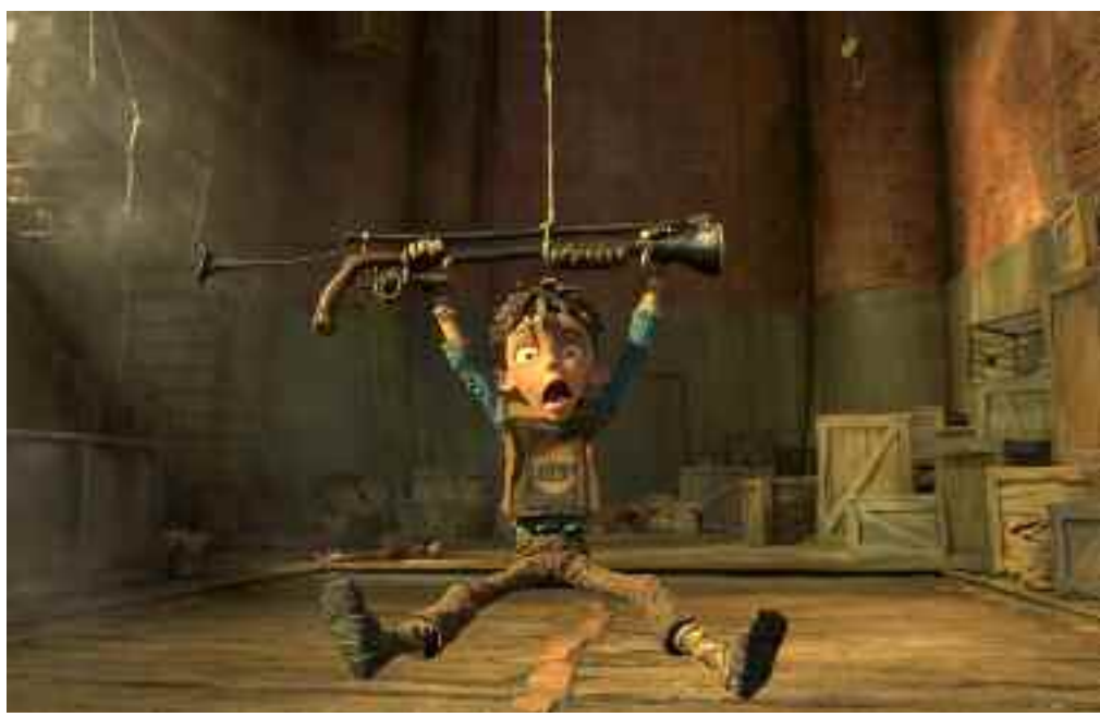
Eleven-year-old Eggs (voiced by Isaac Hempstead Wright) swings into trouble when he tries to rescue a Boxtroll friend in Laika and Focus Features' family event movie "The Boxtrolls."

"The Boxtrolls" comes from the small yet very impressive animation studio, Laika Entertainment based in Hillsboro, Ore. Laika is not a household name like Pixar or Disney but they have produced some of the most imaginative, original, creative and inventive animated films in recent years, including the two Oscar-nominated films "Coraline" in 2009 and "ParaNorman" in 2012. "Coraline" was beaten by "UP" and "ParaNorman" lost to "Brave," which was a disappointment.