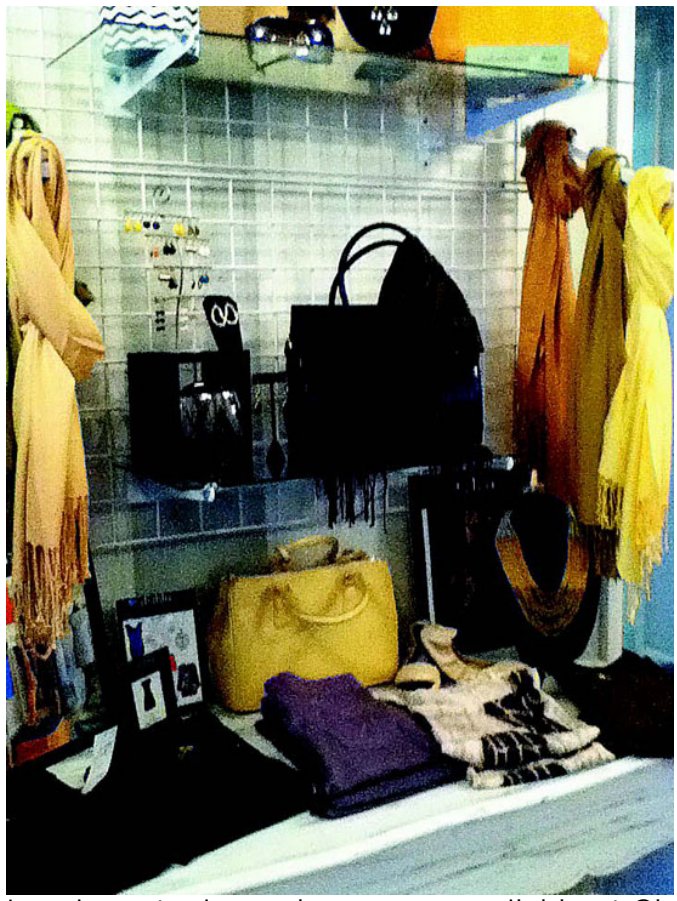
Leggings, tunics and more are available at Glamorous Boutique.

Reach the reporter at: <a href="mailto:info@lamorindaweekly.com">info@lamorindaweekly.com</a>