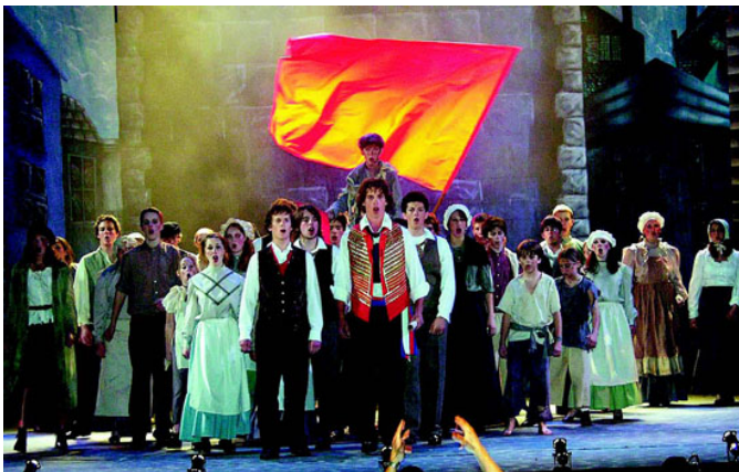
The 2004 cast of "Les Miserables"