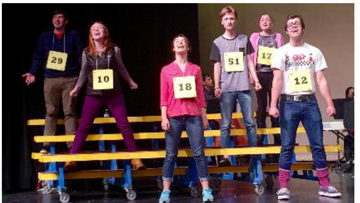
Miramonte High School cast rehearse for "The 25th Annual Putnam County Spelling Bee," which opens with a special show tomorrow at 4 p.m.

The Miramonte Drama and Music Departments present this year's musical, "The 25th Annual Putnam County Spelling Bee." This zany, hilarious production is never the same show twice due to actor improvisation and volunteer spellers from the audience. It also has some poignant moments showing the pressures young children often face to compete