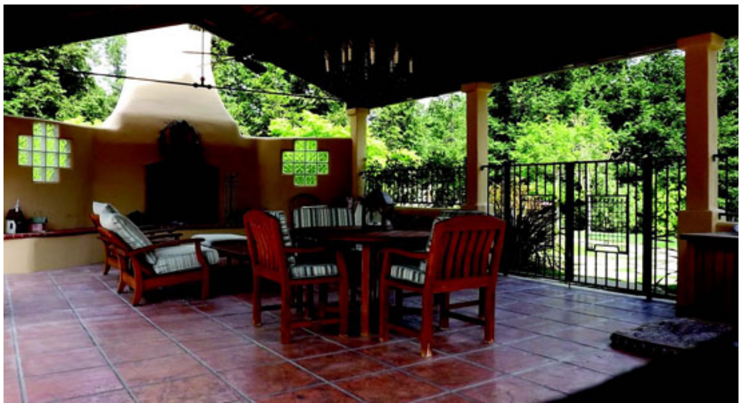
This covered outdoor area with wood burning fireplace at the Rose home in Moraga offers a cozy space for entertaining.

Reach the reporter at: <a href="mailto:cathy.d@lamorindaweekly.com">cathy.d@lamorindaweekly.com</a>