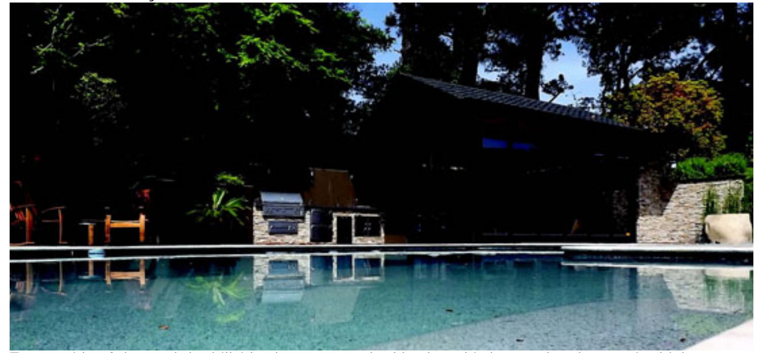
To one side of the pool the hillside slope was pushed back and is kept at bay by a waist-high retaining wall, allowing space for a built-in barbecue, just steps from the outdoor dining room in the Diraimondo's back yard.