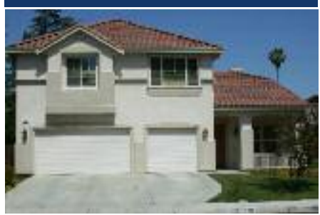
Elegant Luxurious Home Offered at $775,000

EXCELLENT TIME to take advantage of strong demand to get the highest possible price on your home and buy something else while interest rates are still low. They will go up.