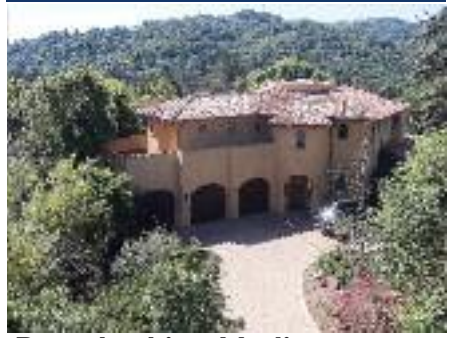
Breathtaking Mediterranean Style Estate Price Upon Request