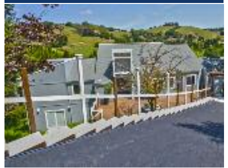
Modern Mansion with Arboreal Views Offered at $1,699,000