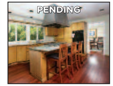
1224 Rimer Drive 4BR/2BA | $1,099,000