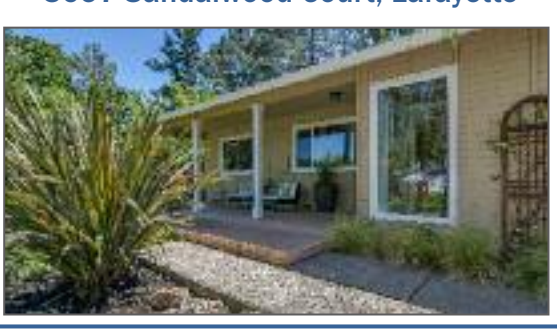
Burton Valley Charmer

Fall in love with this turn-key 3BD/2BA charmer only steps away from Burton Valley Elementary. With 2,184+/- sf., this wonderful home enjoys great spaces and large living areas. Entertain or unwind in the backyard of this fantastic property located on a .32+/- ac. lot. 3097SandalwoodCt.com