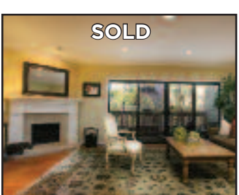
544 Woodminster Drive 2BR/2.5BA | $575,000