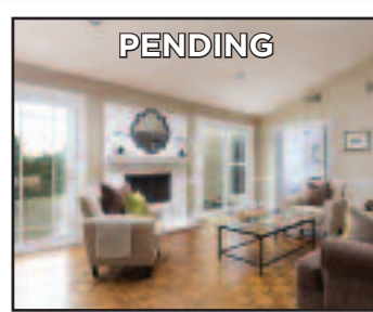
1939 Ascot Drive 2BR + Den/2BA | $624,500