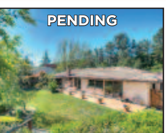
1623 Camino Pablo 4BA/2BA | $950,000