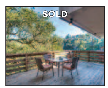
6633 Armour Drive 3BR/2BA | $729,000