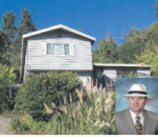
Lafayette ~ Great Acalanes location. Close to BART & Downtown. 4 bdrms, 2.5 baths, Flat backyard & Views from every room. Possible Au-Pair/In-Law. $1,049,000

Dale Price 925.785.9035 daleprice@daleprice.net