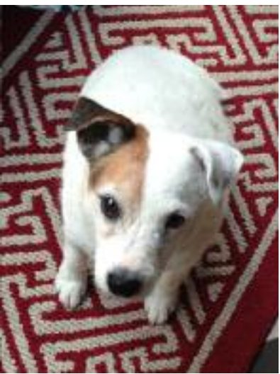
Red represents fire, and fire creates earth, so this red rug placed in the Health area of a Moraga home generates healthy energy.

Remember, when you have your health you truly have it all!