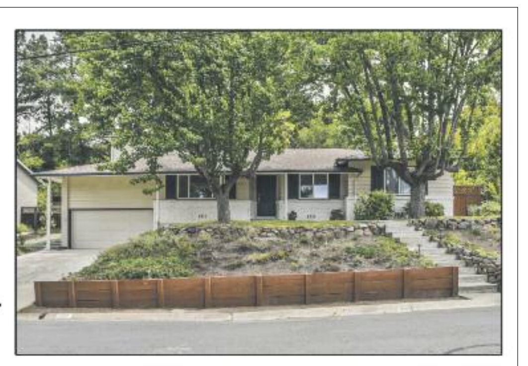
COMING SOON! 402 Castello Road, Lafayette

paddykehoe.com 925-878-5869 paddyrealtor@gmail.com BRE#01894345