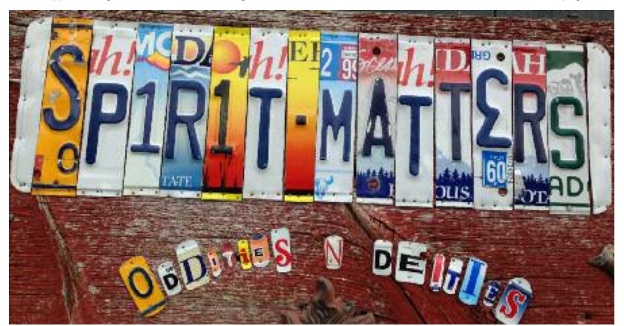
Multi-colored pieces represent all five elements in tai chi and help achieve yin-yang of the Health sector. Metal art is appropriate indoors or out.