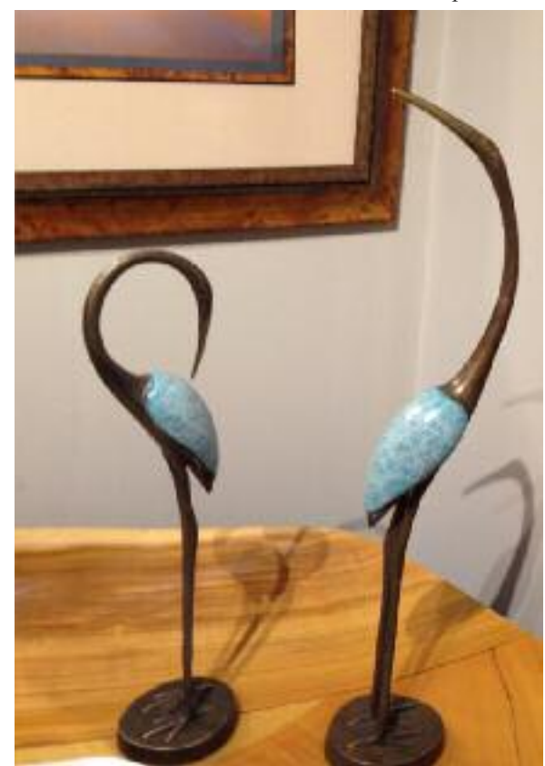
Decorative metal cranes are ideal for the Health sector, like in this Orinda home, and remind us of a long healthy life.

hen we have good health we truly do have it all. Health and well-being is not just related to physical health but also to mental, emotional and spiritual well-being. Finding balance in our lives is healthy and is what is desired by so many, yet it eludes the vast majority of us. Just as we attain balance in one area of our lives, another area goes haywire.