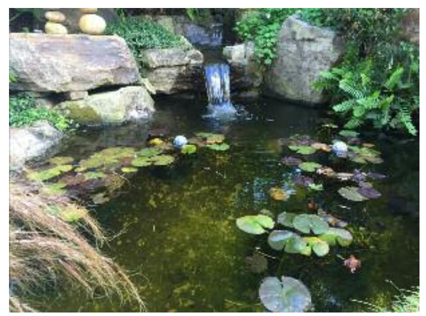
The brook ends with a cascading waterfall into a natural looking pond with koi and Flash, the turtle.

Their dream of a secret garden has been realized as they share the view together, toasting Father's Day with a glass of their private label Turtle Crossing wine.