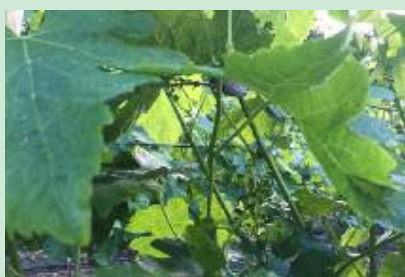
The Syrah blossoms on the vines.

ROTATE crops. Don't plant vegetables in the same spot as last year.