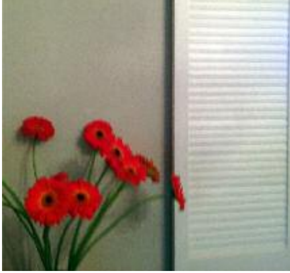
Orange zinnias in this Lafayette home helps Health bloom.