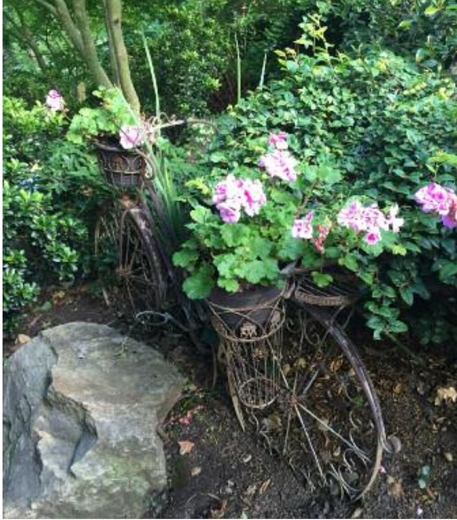
Baskets of geraniums grace an old bicycle.

"The most beautiful view is the one I share with you." ~ Source unknown