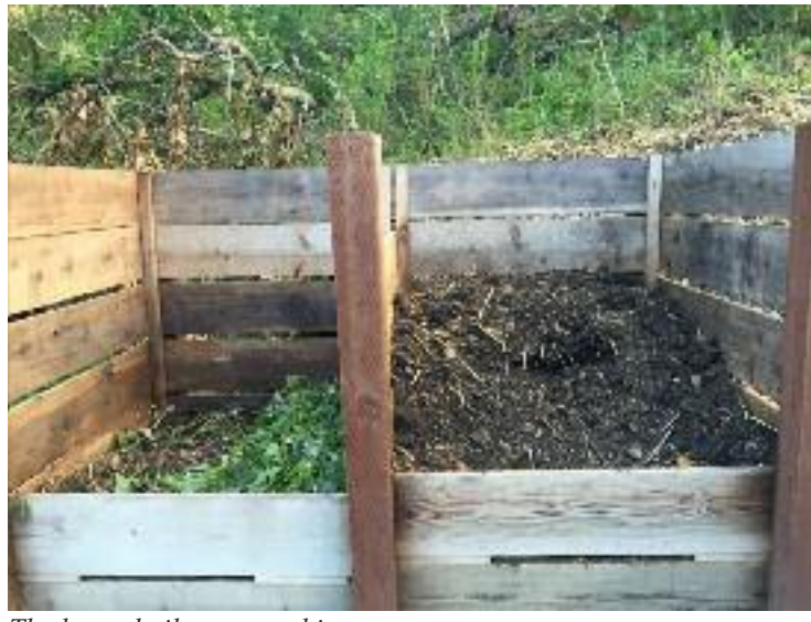
The home-built compost bin

An underground spring augments their watering system. Bob's efficient home-built compost bin resides outside the fence, ready to nourish the garden organically.