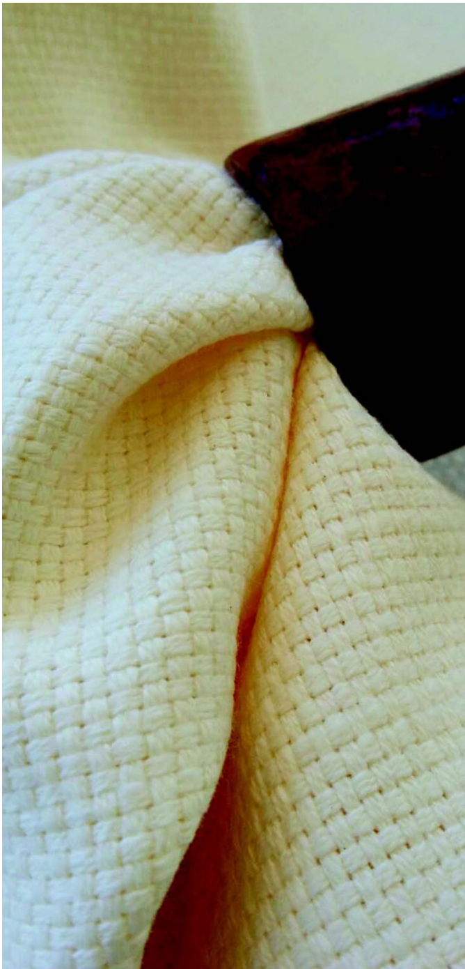
This napkin set was made out of designer fabric and napkin rings from the Gift Show in North Carolina.