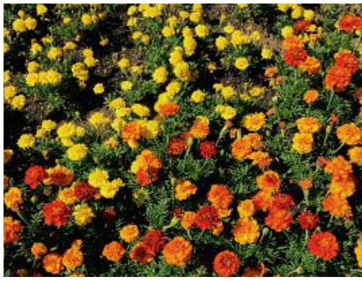
Marigolds are a favorite summer plant.

Take care of your birds and they will take care of your garden. Life is for the birds!