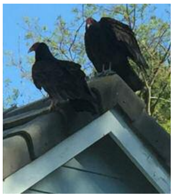
I thought I was in a remake of the classic film, "The Birds" when vultures and crows swarmed my rooftop.