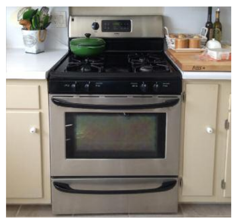
Proper stove feng shui includes keeping the appliance spotless. A white kitchen shows off food vibrancy the best, as at this Moraga home.

Whether you are cooking up some grilled vegetables, salmon, sautéing a mushroom base sauce or stewing summer fruit for a pie, remember auspicious kitchen