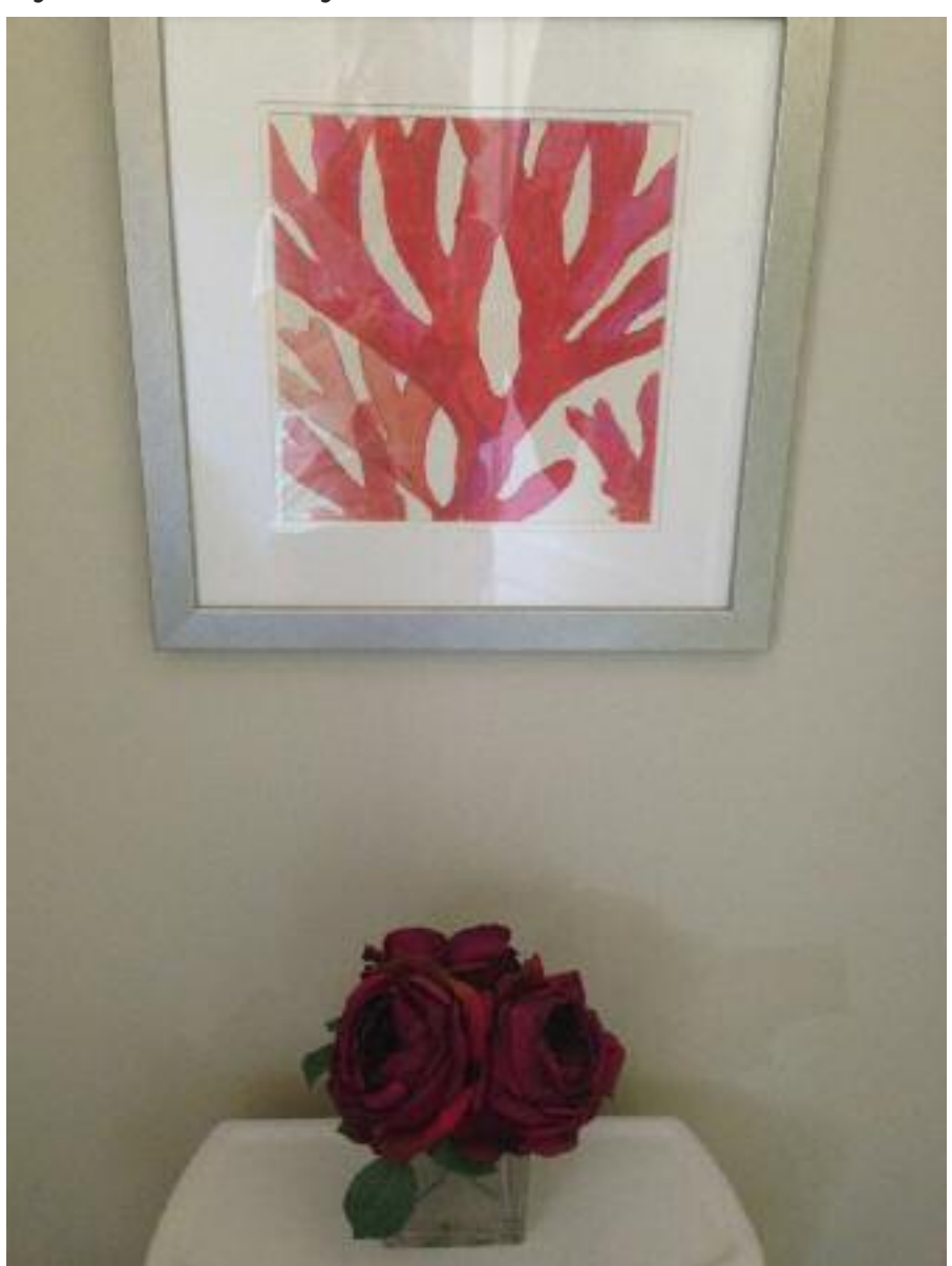
Artwork and accessories are a great way to express the Fire element of summer like in this Orinda bathroom. Photos provided

ood kitchen feng shui is especially important to fuel all of our passionate adventures of exploring in life. Good feng shui for the kitchen begins with clean and tidy counters, floors, the refrigerator and especially the stove to prepare your foodie masterpieces.