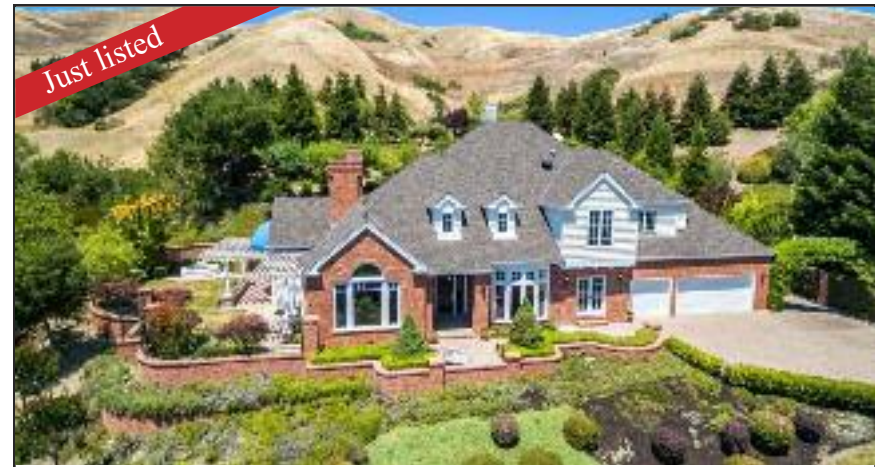
50 Merrill Circle North, Moraga | Open Sat. & Sun. 1-4 pm Stylishly appointed custom home consists of 4 BR+ Office, 3.5 BA, 4219 sq. ft. on a 1+ acres of park-like grounds featuring an elegant living room, formal dining room, gourmet kitchen and a large family room. The open floor plan, expansive windows & French doors creating a seamless transition between interior and exterior space for memorable entertaining and ultimate relaxation. Offered at $2,385,000