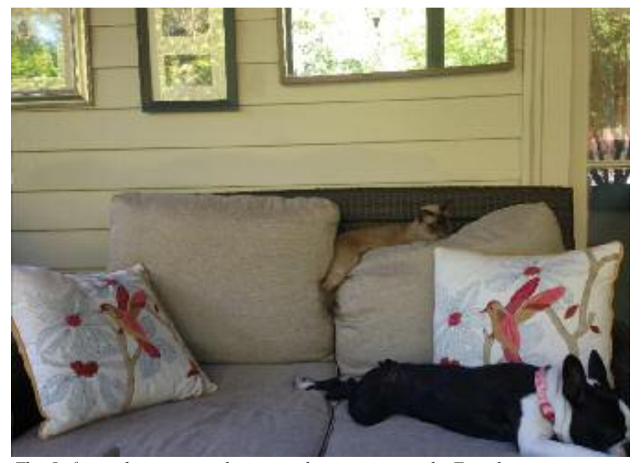
This Lafayette home uses red summery hues to activate the Fire element.

Essential kitchen feng shui also includes proper lighting, so you can see what it is you are cooking or preparing. Puck lighting under cabinets can direct light to food preparation areas, cutting-edge crystal chandeliers illuminate and recessed lighting with dimmers all lend themselves to create atmosphere with form and function in mind. ... continued on page D10