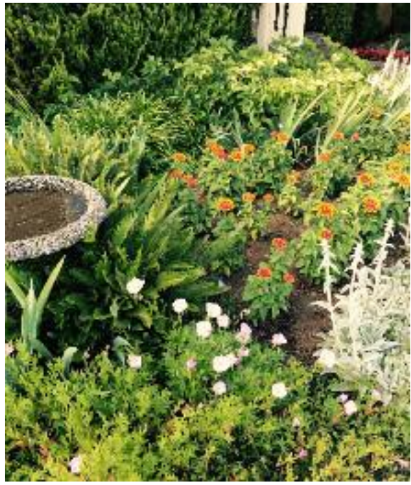
Make sure to have a birdbath. Plant zinnias and other plants that birds will enjoy.

re you attracting birds to your backyard? In the past few months, I have received numerous emails and calls from readers literally around the world asking questions about our flying friends. Many people have indicated that the bird population has increased in their landscaping, with some gardeners enjoying first-time visitors.