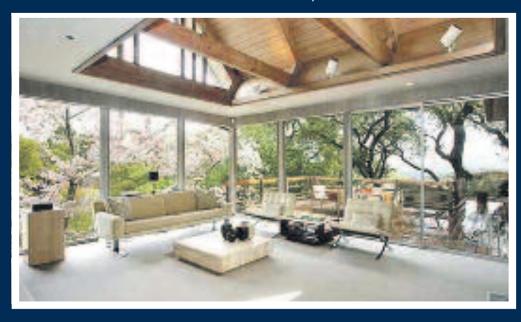
SOLD! 220 Glorietta Boulevard, Orinda