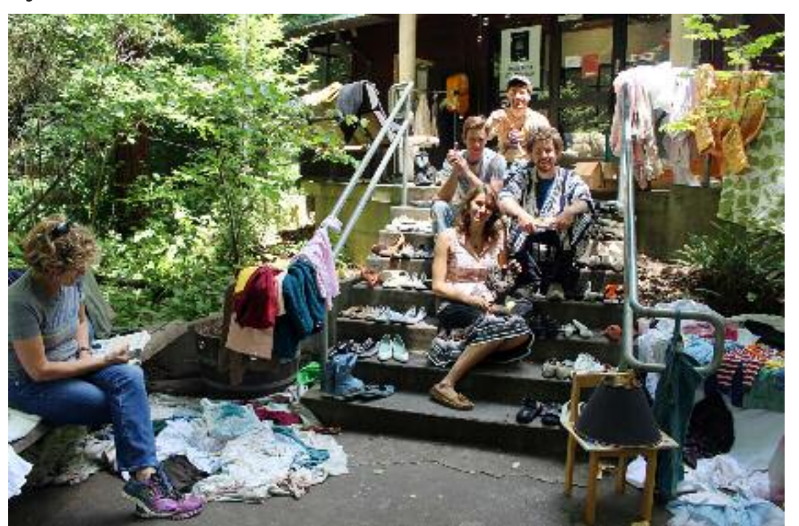
Items are displayed at this recent "Free Swap" in Canyon.