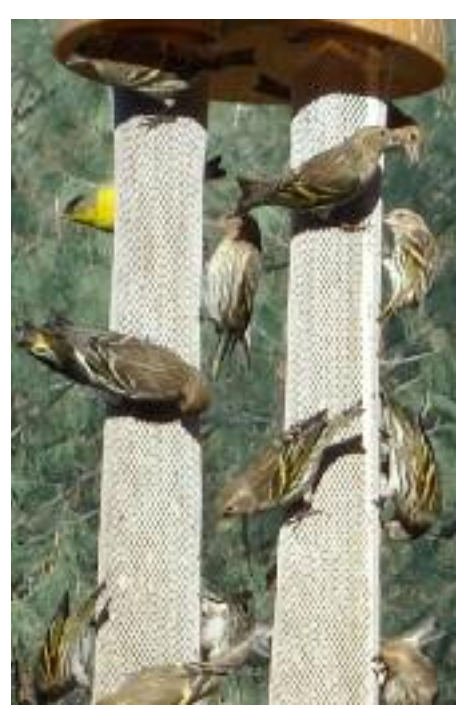
Finches feeding at a garden feeder