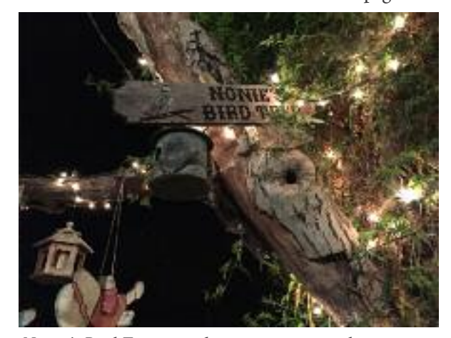
Nonie's Bird Tree at night is an ancient walnut.