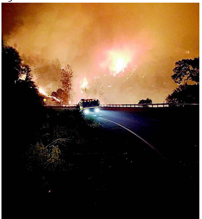
Moraga-Orinda Fire District firefighters hold the Rocky Fire south of Highway 20 near Clearlake

When you talk to firefighters from either of the Lamorinda fire agencies who left the area to fight California wildfires this season, you realize that the fires affect not only those at the incident but those whom the firefighters leave behind.