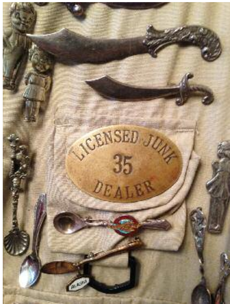
Knapp's signature vest