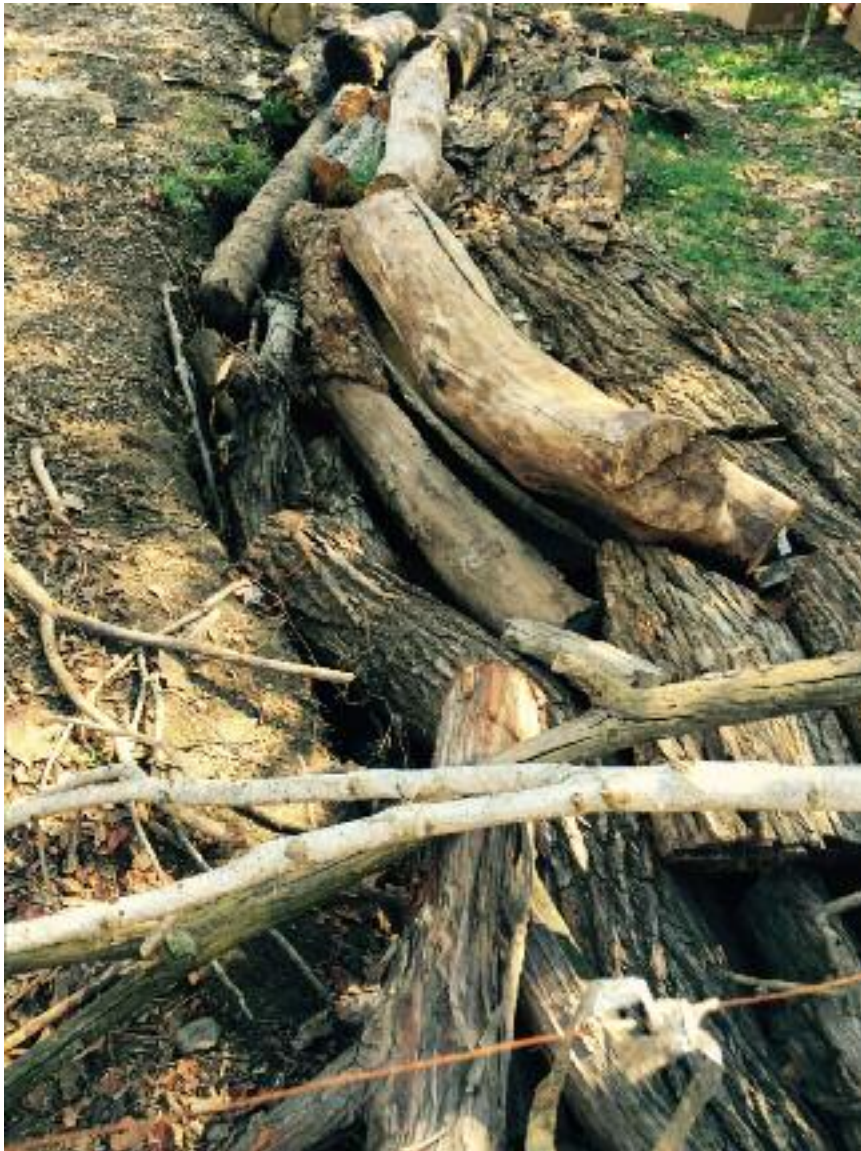
A hugel is born with logs, branches, and twigs.