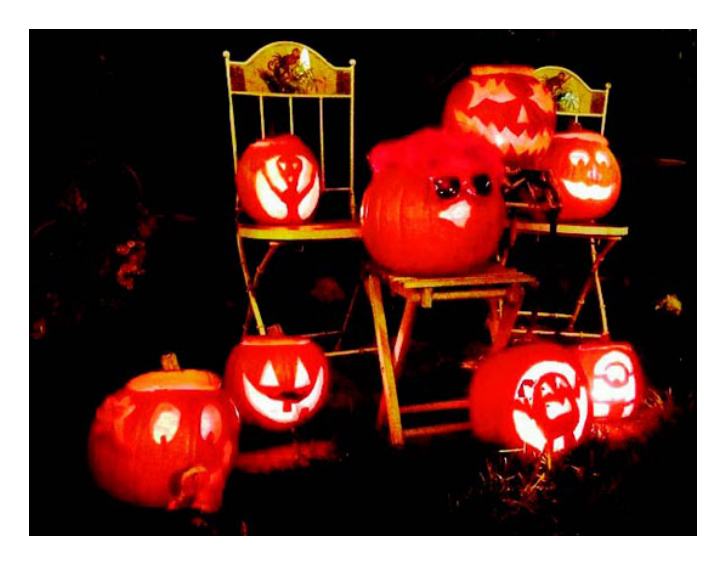
Jack-o'-lanterns light up the landscape.

The season of screams and scares is officially here! Halloween is right around the corner, and it's time to embrace your inner ghoul. With only a few days left until a haunted eve, a walk in the park or around your personal garden will spark your spooktacular spirit as you encounter everyday species that ignite eerie imaginings, yet are friendly visitors. It's time to put out our mystical welcome mat.