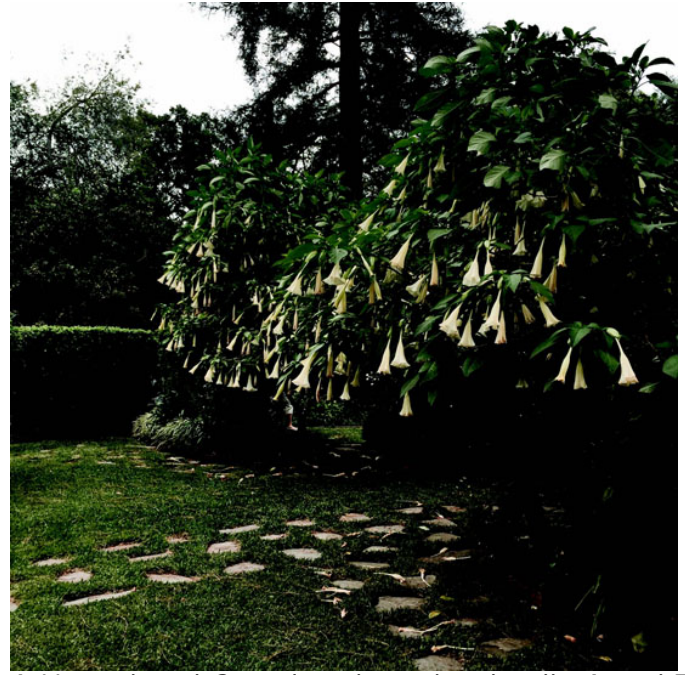
A Hansel and Gretel path to the deadly Angel Trumpet Bush