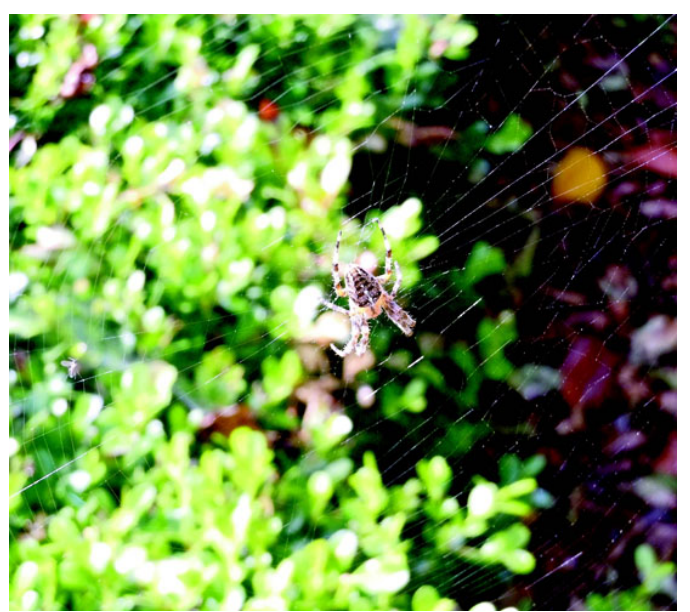
An argiope spider weaves its web to catch its prey.