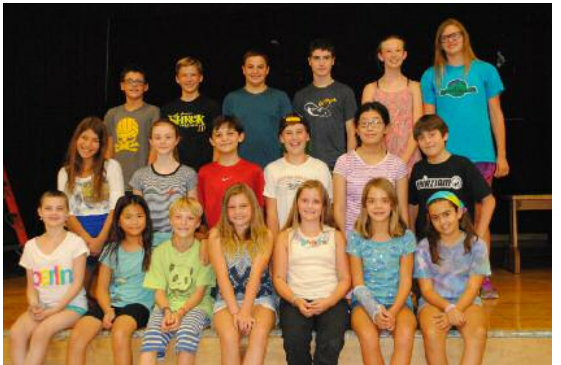
The "Transyl-Mania" Zombie cast