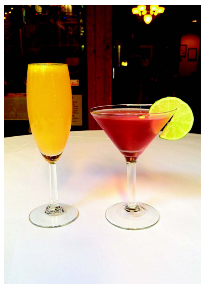
When: 2-5:30 pm, Monday-Sunday Where: 100 Lafayette Cir #101, Lafayette Drinks: $2 off all beer, wine and cocktails Recommended: $8 Cosmopolitan and $6 Fresh-squeezed Mimosa

Reach the reporter at: <a href="mailto:info@lamorindaweekly.com">info@lamorindaweekly.com</a>