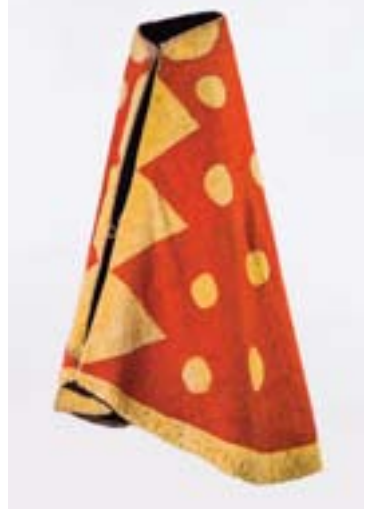
Feather cloak exhibited at the de Young Museum.

With forecasters saying we just might get a wet winter, and lots of