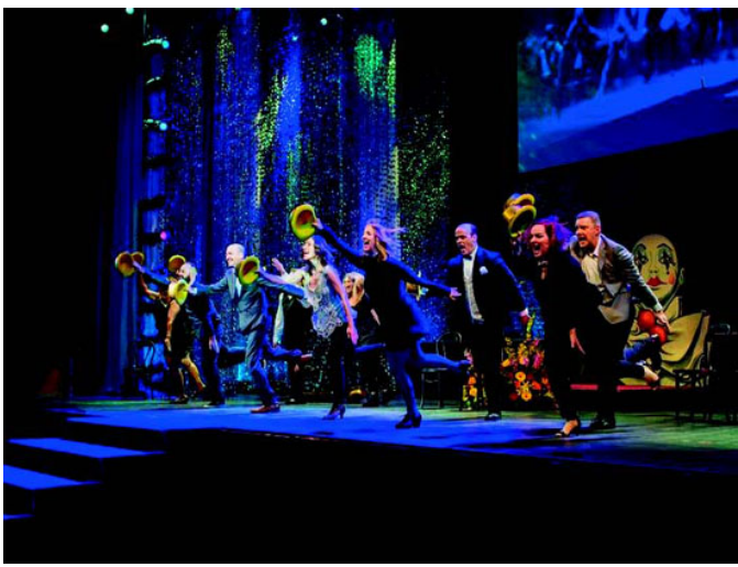
Town Hall Theatre cast of "Company" performs at the Jan. 16 Shellie Awards in Walnut Creek.

both Part I and Part II, which cost $25 to $32, can be purchased online at www.townhallthreatre. com or by calling the box office at (925) 283-1557.