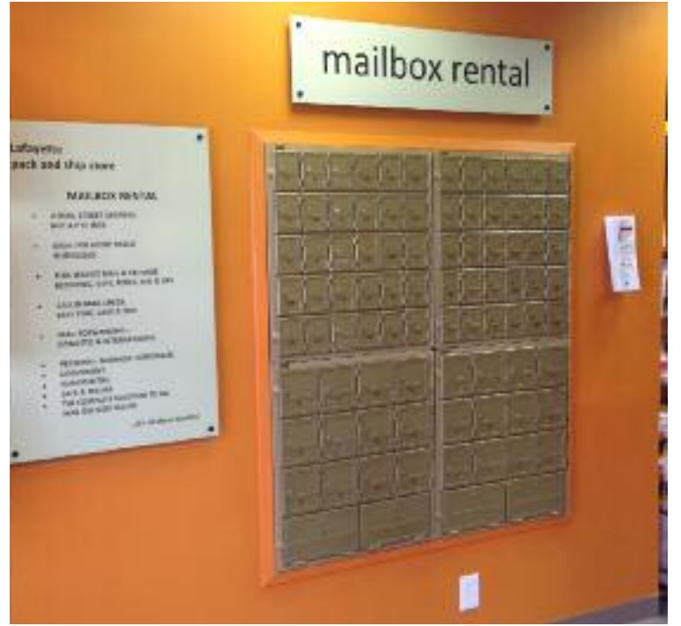
There are 84 mailboxes located at the Lafayette store.