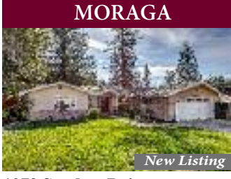
1072 Sanders Drive Light & bright fully remodeled and expanded 4 bedroom, 2 bath plus office on a level creek-side .27 acre lot. Close to K-8 top schools!

1807 St. Andrews Drive Wonderful executive lease opportunity in Moraga Country Club: 4bed/2.5ba (or 3bd + large ofc) 2828 sf., remodeled w/views! FULL MCC membership included.