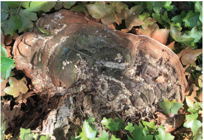
The ugly tree mushroom growing at the base of the tree.