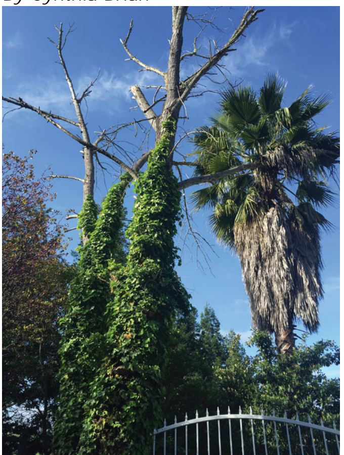
The ivy growing up the cottonwood and the shaggy palms.

"Trees are poems the earth writes upon the sky" - Kahlil Gibran