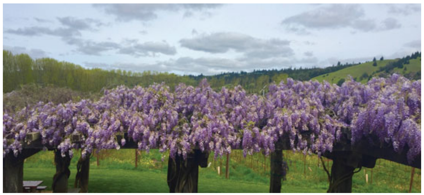
A stellar showing of short lived grape-like clusters of purple wisteria twine through an arbor.