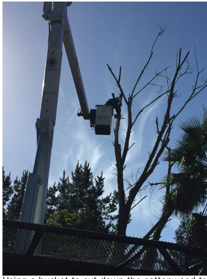
Using a bucket to cut down the cottonwood tree.

ALLOW the leaves from bulbs that have completed blooming to turn brown and crispy. Daffodils and narcissi require this procedure to refuel the bulb for next year's flowering.