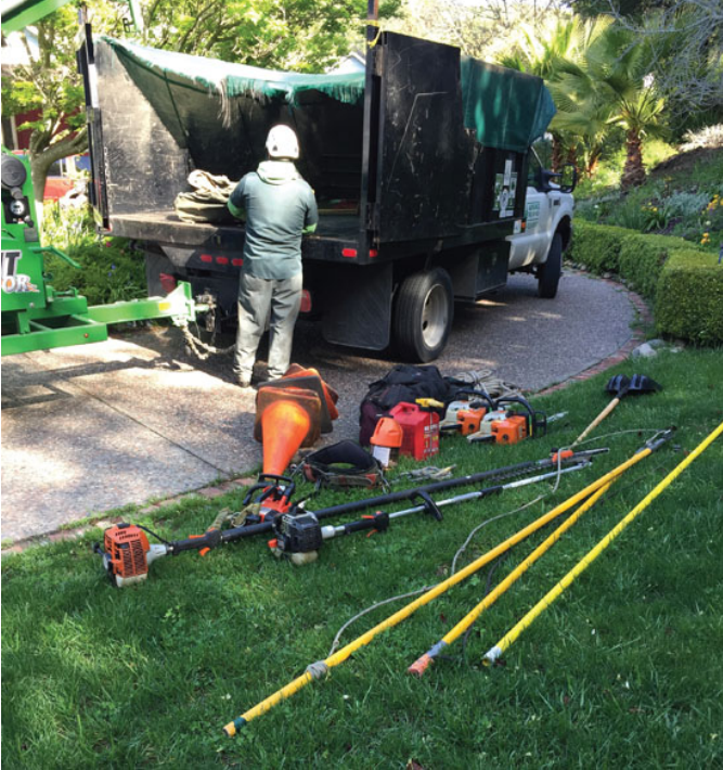
Equipment for tree cutting.