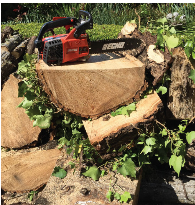
Free wood chips and firewood are offered to customers.