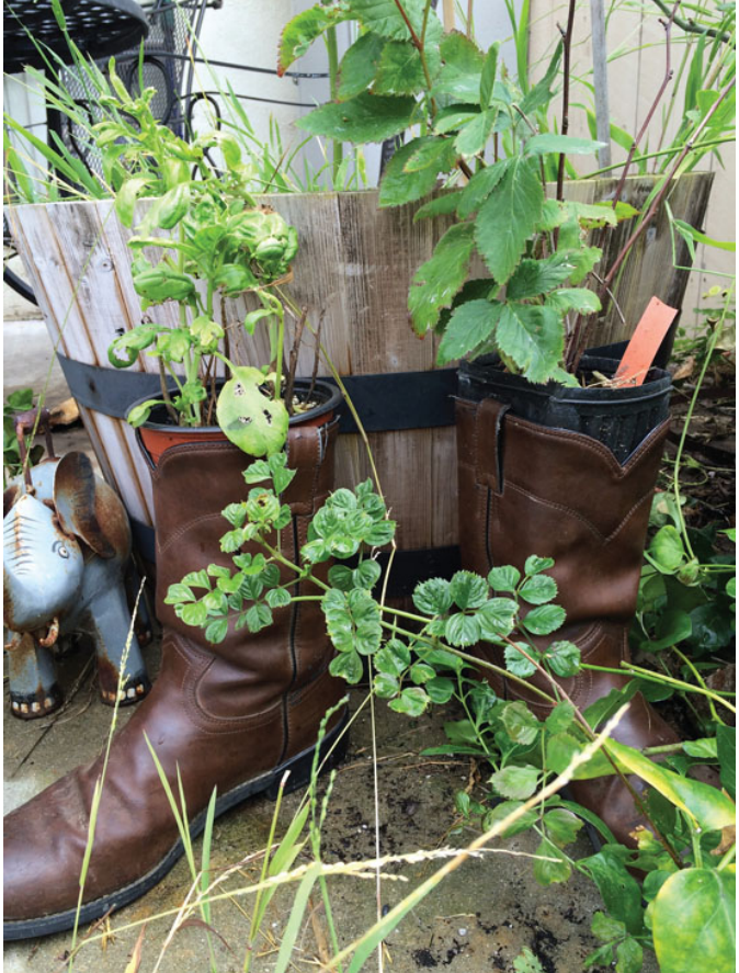
Get creative by planting basil in an old boot.