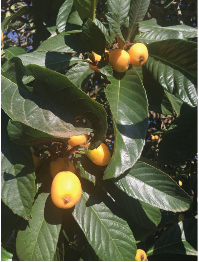
Loquats are plump and juicy.

What's summer without a wall of brilliant bougainvillea