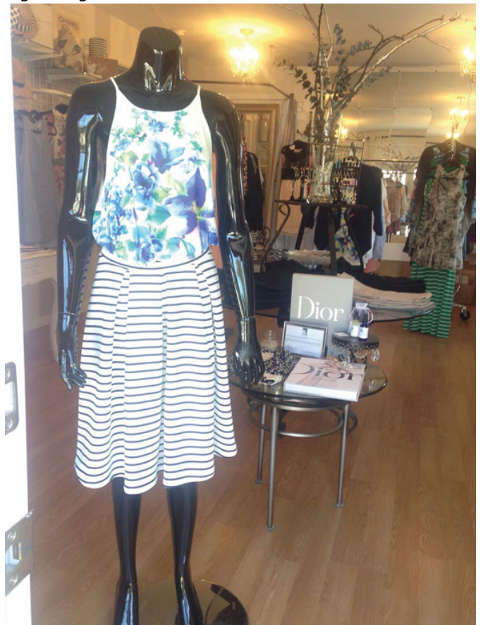
Stay cool in stripes and prints from Glamorous Boutique in Lafayette.

Summer has rushed into Lamorinda bringing along bright sunny days and high temperatures. It's time to put away the woolens and pull out the whites.