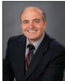
Certified Residential Lamorinda Specialist 31 Years Orinda Resident

"Why do I stay here? Why not? I'm happy, my family is happy. What is more important than that?"