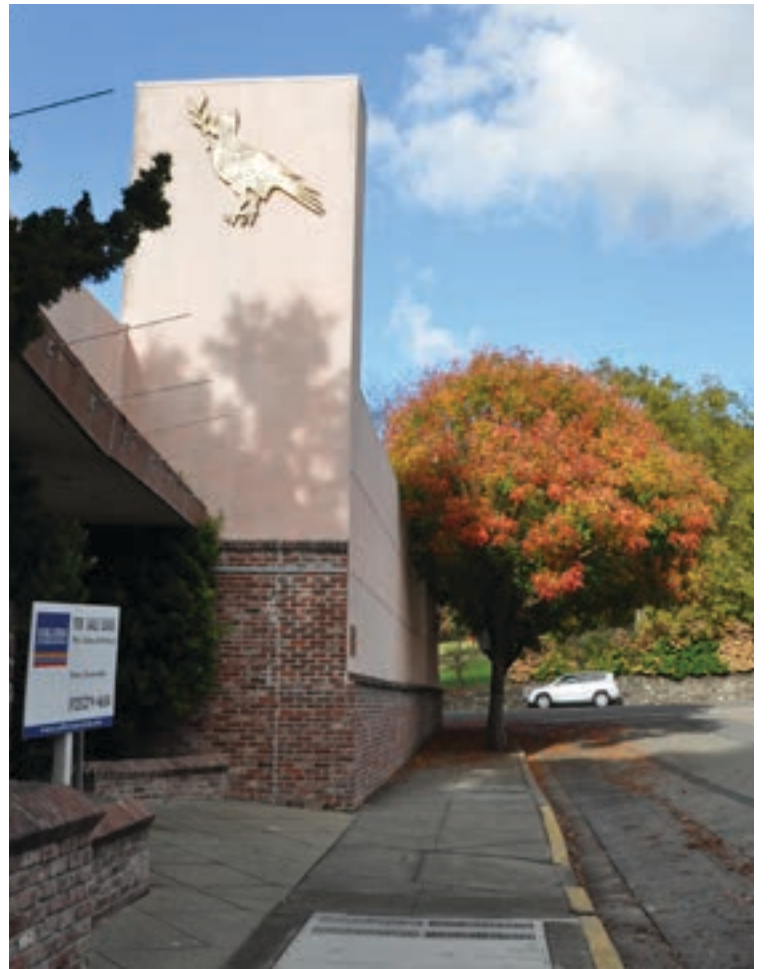
The entrance to the empty Phair building.

The council asked the ULI representatives if they have worked on cities similar to Orinda. They mentioned Hercules, the Point Molate area of Richmond, Concord and Brisbane. Brisbane is quite similar to Orinda in size, but not in composition. Brisbane had a large industrial center which, since the recession, was almost vacant and the city was almost bankrupt. There was no downtown grocery store, no drug store, no gas stations, and only lunch restaurants. The Brisbane