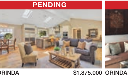
4/3.5 Fantastic remodeled ranch home. Vaulted ceilings, great room opens to