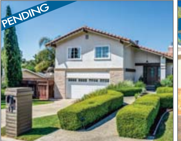
17 Mayfield Place, Moraga

4BD/3.5BA, 2,422+/- sq. ft., .80+/- acre