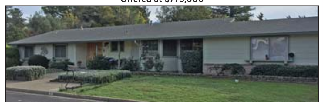
PENDING | 2 Donald Place, Moraga Offered at $1,098,000