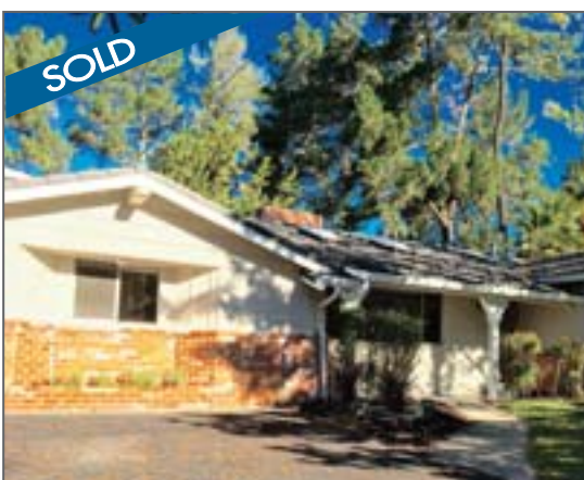
13 Bates Boulevard, Orinda