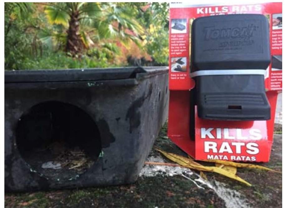
The best rat traps are these quick set reusable snap traps.