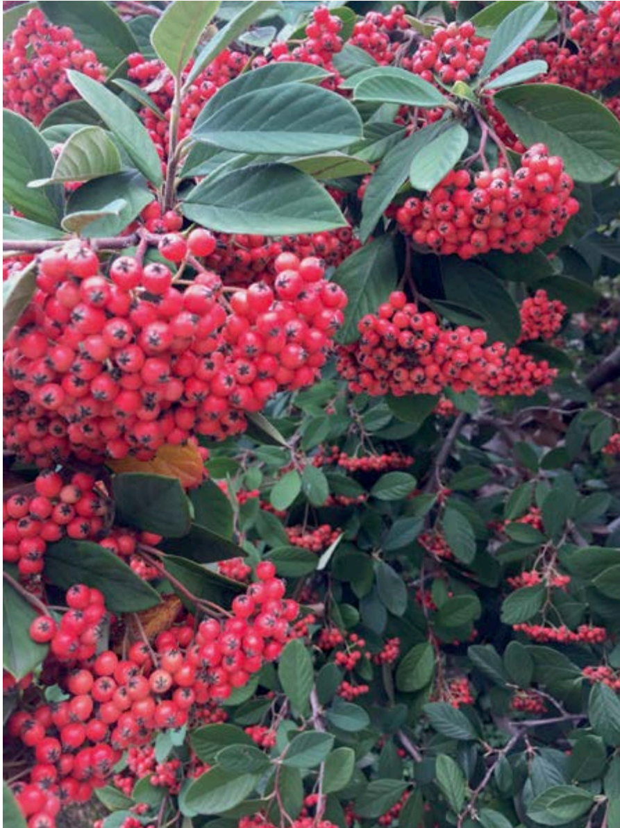
Cotoneaster berries add sparkle to the season.

“Regardless of your lot in life, build something beautiful on it.” ~ Zig Ziglar