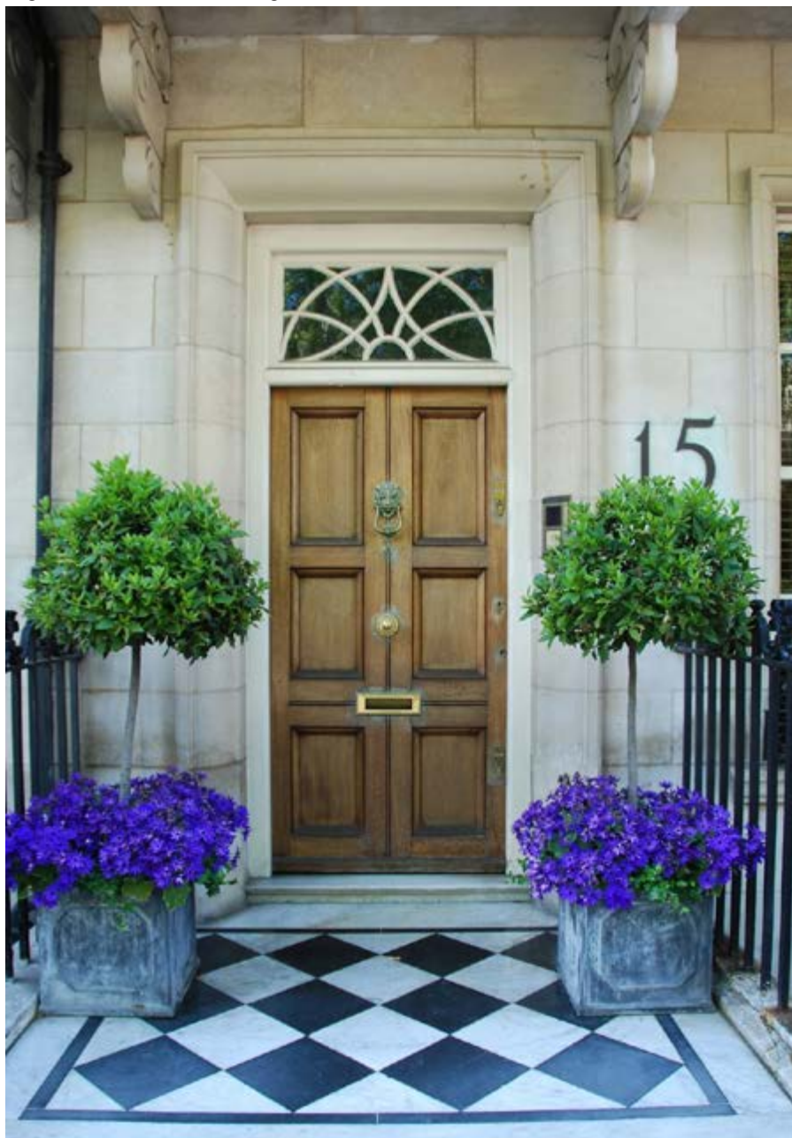
This Lafayette home attracts wealth with flanking the front door with visibly stylish pots.

So many of you have written to me about wondering how feng shui can help to you lead lives with less stress, more personal happiness, greater balance and a deeper experience of abundance & prosperity. One of my favorite quotes is “Gratitude is the doorway to Abundance,” since to truly be abundant we must acknowledge what we are already so lucky to have!