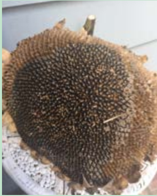
A sunflower produces seeds for scattering.

Wishing you a very healthy, happy, and beautiful December where the wild things aren't!