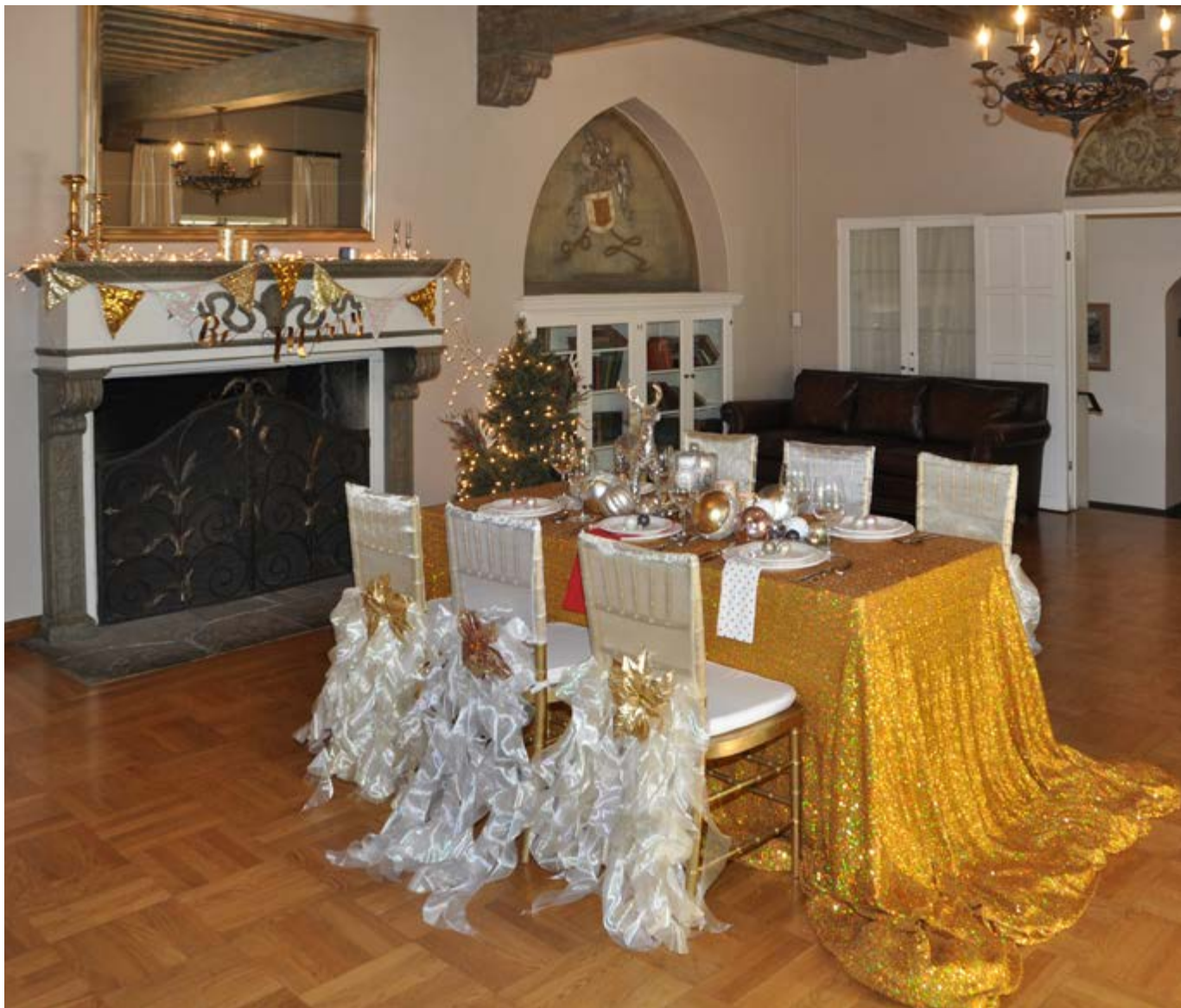
An elegant dining table with sequined accents highlights the Hacienda's de las Flores' great room.