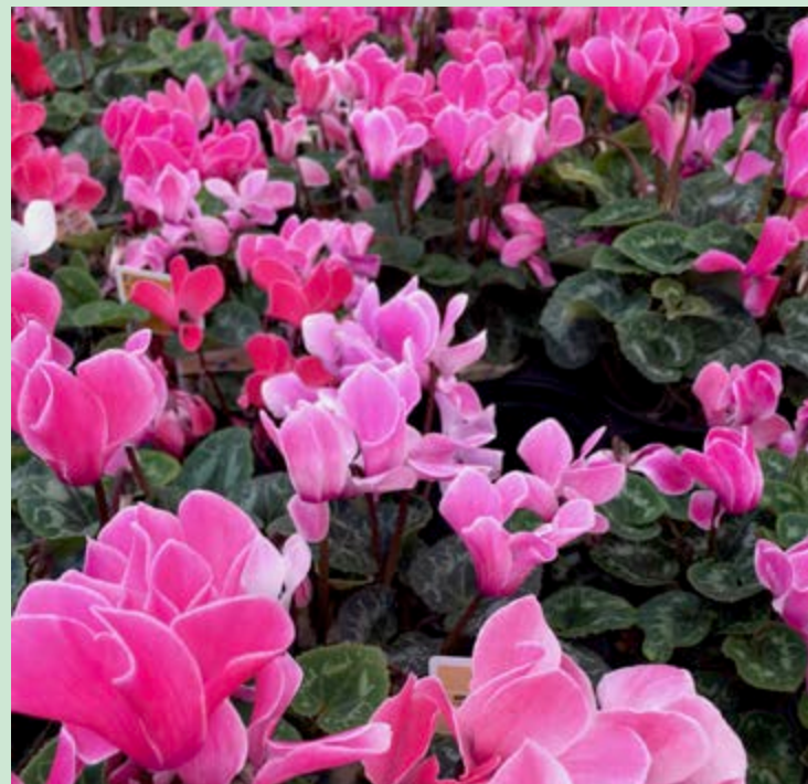
Who wouldn't love these hot pink cyclamen?

There is nothing beautiful about pests finding shelter in our homes and gardens but this month does bring beauty to our doorsteps.