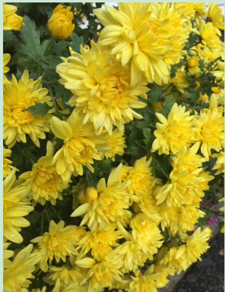
Yellow mums offer a sunshine welcome.