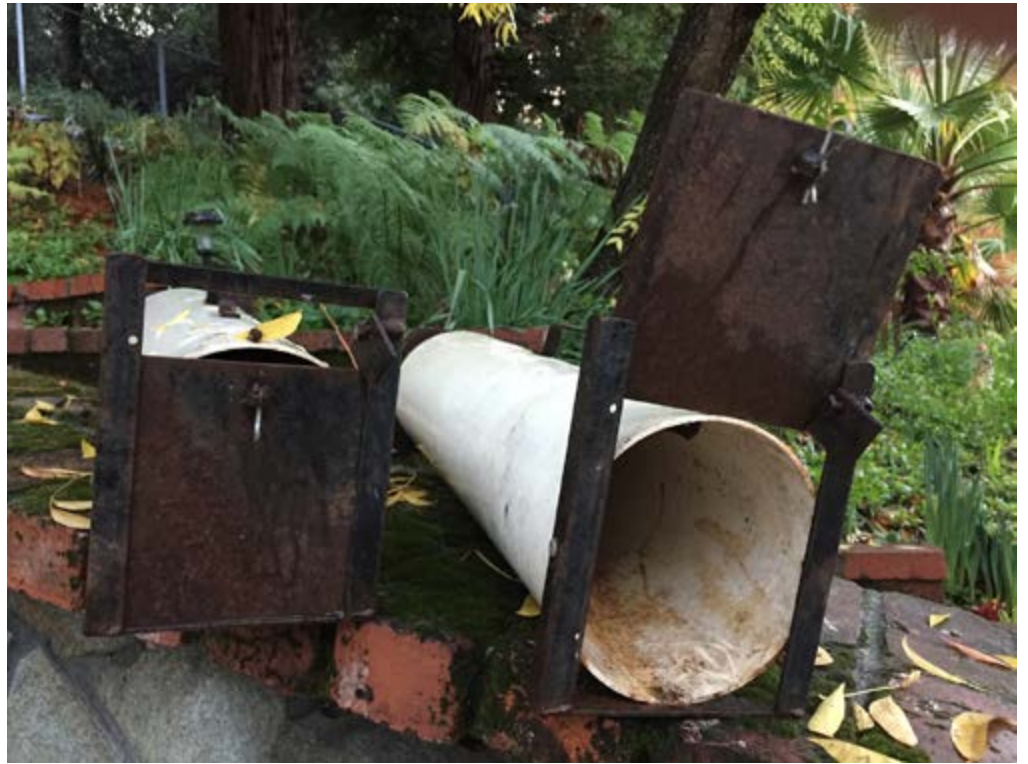
A skunk trap.