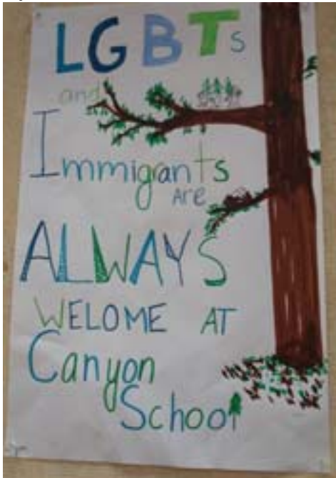
Everyone is welcome, but they'll have a tough time getting there.