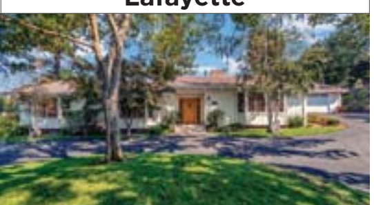
3216 Los Palos Circle 3Bedroom/2Bathroom Main Home, 2362± sq. ft. 2Bedroom/2Bathroom Guest Home, 600± sq. ft. Offered at $1,995,000