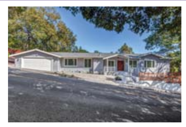
14 ST. STEPHENS DRIVE, ORINDA New Price: $1,695,000 2966 sq. ft. + in-law unit, .66 acres