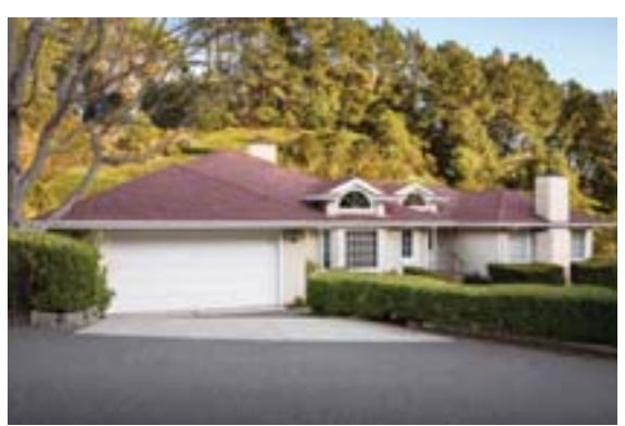
1 MONTEREY TERRACE, ORINDA Coming Soon in February 3483 sq. ft., 2.66 acres