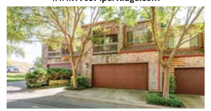
Open Saturday & Sunday I-4 PM