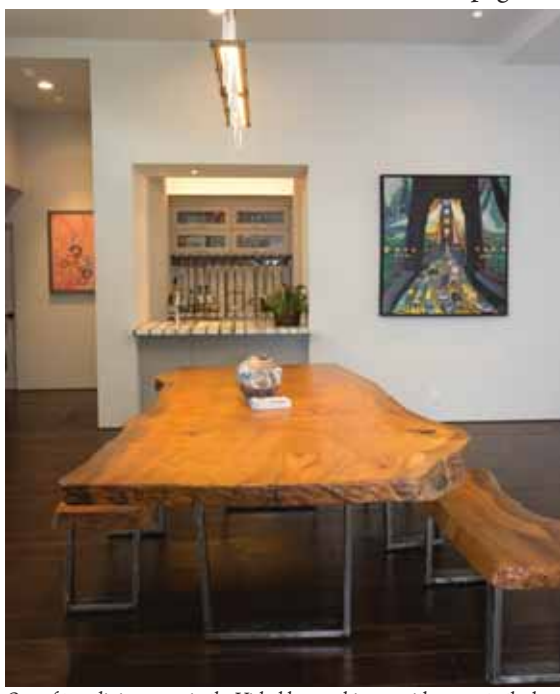
One of two dining areas in the Visbal home, this one with access to the bar.