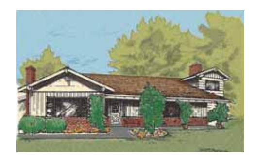
TRAIL/BURTON VALLEY OFFERED AT $1,375,000