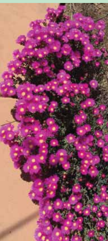
Along a path, fluorescent pink ice plant sparkles.