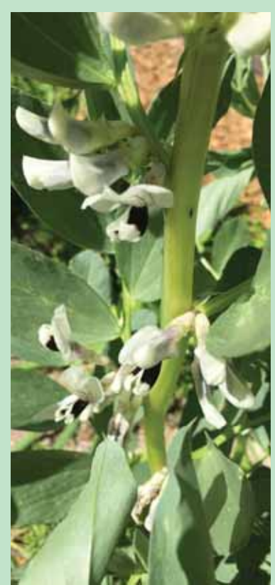
The cover crop of flowering fava beans.