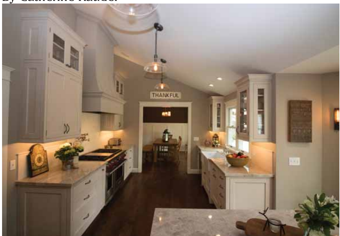
Lori and Scott Loughran-Smith's bright kitchen leads into the casual dining area. The pantry is behind the island.