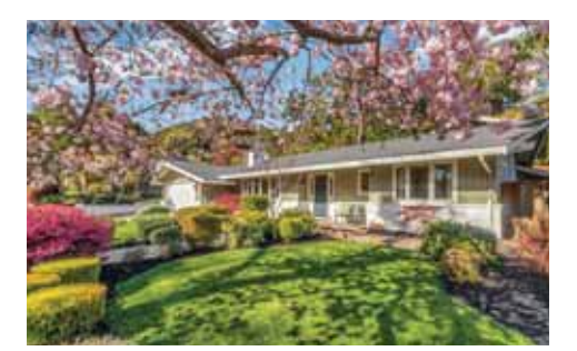
521 SILVERADO DRIVE OFFERED AT $1,795,000