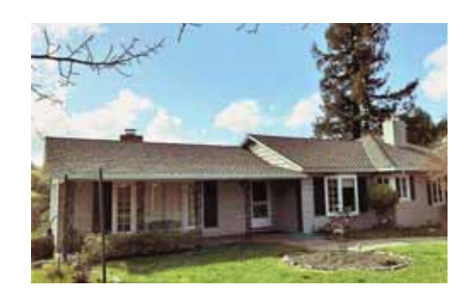
TRAIL/BURTON VALLEY OFFERED AT $1,395,000