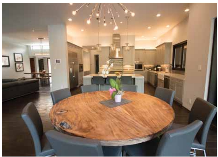
The second dining area in the Visbal home features a City Lights starburst pendant lighting fixture.

Founded in 1953, Lafayette Juniors is a nonprofit organization comprised of local women dedicated to raising funds and offering service in support of other non-profits that serve women, families and seniors in need throughout Contra Costa and neighboring counties in the San Francisco area. Over the past 18 years, the Lafayette Juniors have raised more than $700,000 for Bay Area nonprofit groups.