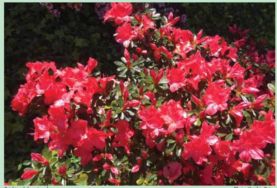
Bright and elegant azaleas.