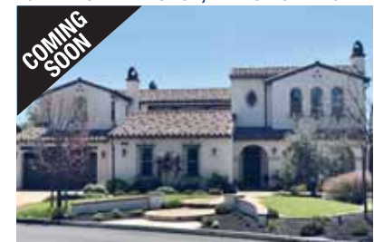
ZOCCHI & ASSOCIATES