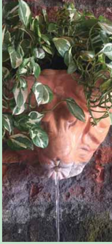
Ivy cascading from a fountain is attractive and can't spread.