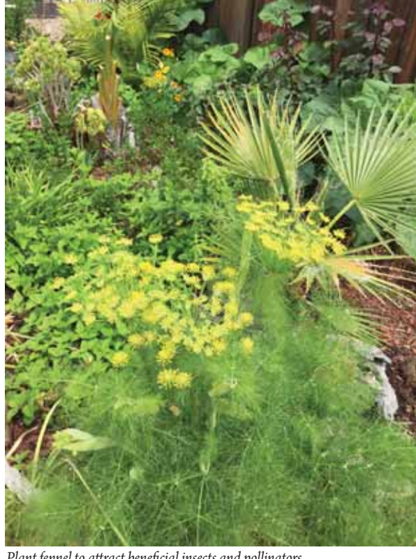
Plant fennel to attract beneficial insects and pollinators.

Then a 17-day freeze occurred, killing most of my plantings. When spring arrived, many of the plants sprouted once again but this time they were yellow, orange, white, or red. The hybrids had reverted to their na-