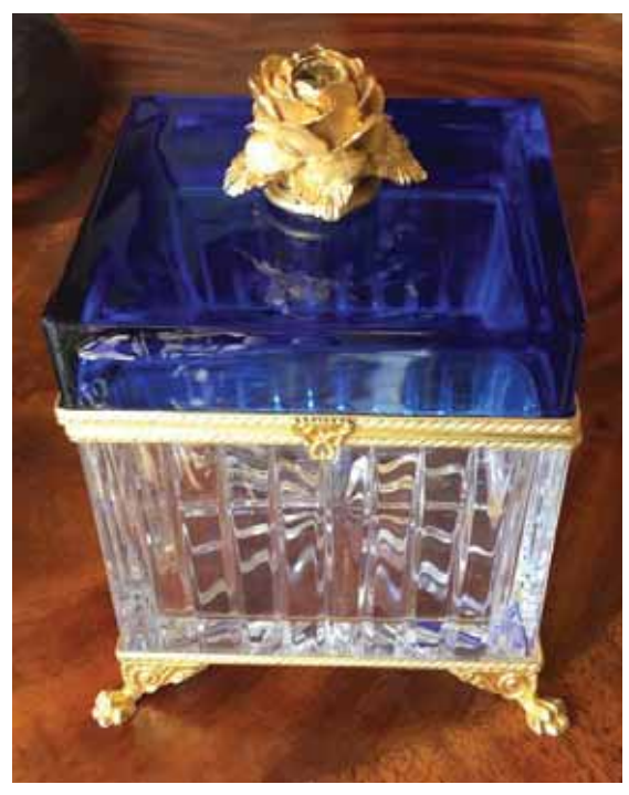
Square (Earth) crystals are great gifts for mom to honor the grounding she brings to life.

oon we will be honoring the legacy of our mothers, if they are (or were) an important part of our lives, and we should also honor the feminine in ourselves too. So thinking about the role all of our mothers in our lives makes it an opportune time to align with the grounding symbology of mothering, and the loving maternal. "Mother" is a nurturing and positive reference in most cultures, and mom's strength, generosity, kindness, and consistency of character and love, are represented in varied cultural threads that also reflect the rich cultural traditions of celebrating "mother" around the world.