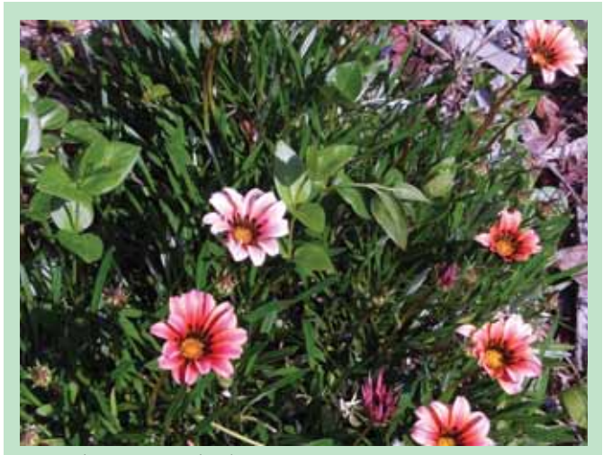
Burgundy gazania mixed with vinca major.