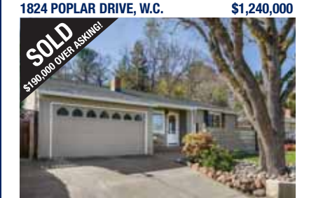
ZOCCHI & ASSOCIATES