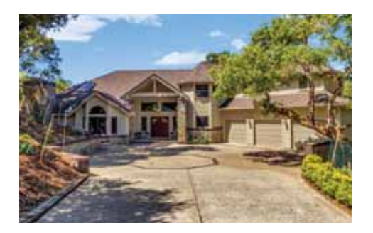
4 SHANNON COURT, MORAGA OFFERED AT $2,200,000