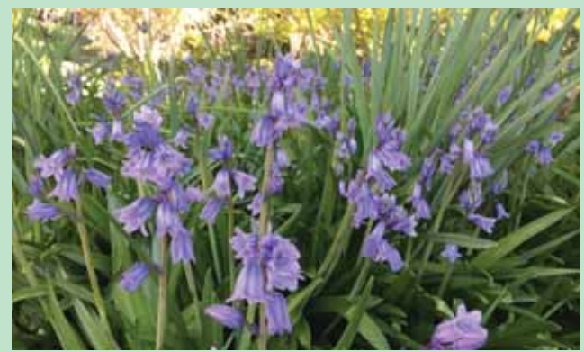
Sky blue wood hyacinths.