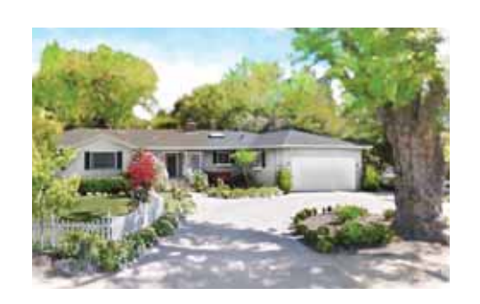
854 SOLANA DRIVE LIST PRICE TBD