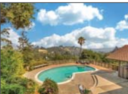
1217 Upper Happy Valley Road, Lafayette | Offered at $1,350,000 | Sale Pending in 7 Days

Nestled into the sundrenched Lafayette hillside up a secluded drive in the prestigious Happy Valley neighborhood, rests this classic 4 bedroom/2.5 bathroom, 2385\pm sq. ft. original Jack Marchant home. Built in 1967, Marchant was long acknowledged as a leading force in the movement of suburban design embracing the "Modern California Living" concept. With the unmistakable influence of world renowned architect Frank Lloyd Wright, Marchant was known for his walls of glass, open beam ceilings, generous living room with striking floor to ceiling fireplace and formal dining room with his hallmark "expansive views". On .57± acres with sweeping views of the hillside and Mount Diablo, mature trees and landscaping and a sparkling pool. Close to downtown Lafayette shopping and BART.