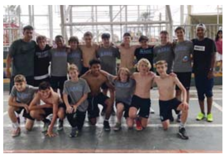
Making Magic in Curenvaca, Mexico orphanage.