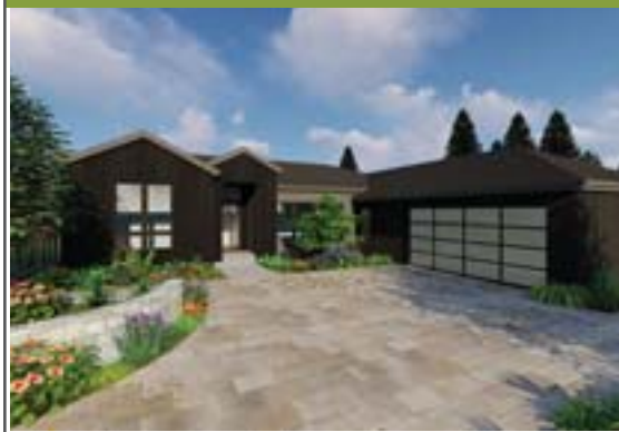
1369A Reliez Valley Road.com .62± Acre Lot + Plans | $1,395,000

Premium Lafayette Land + City Approved Building Plans