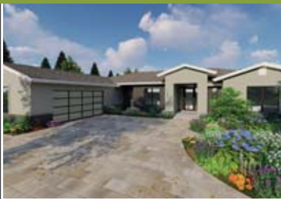
1369B Reliez Valley Road.com .64± Acre Lot + Plans | $1,475,000