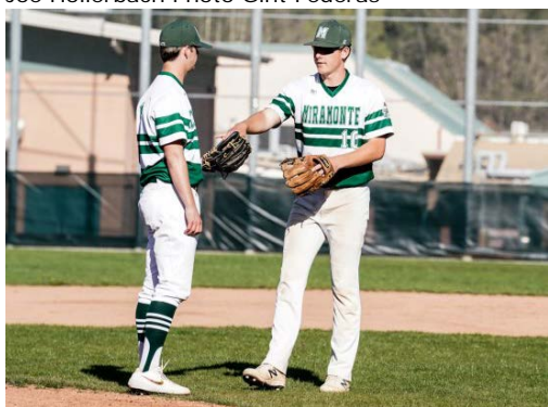
Joe Hollerbach Photo Gint Federas

Reach the reporter at: sportsdesk@lamorindaweekly.com